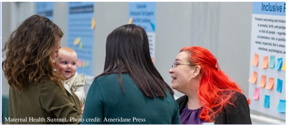
Maternal Health Summit.