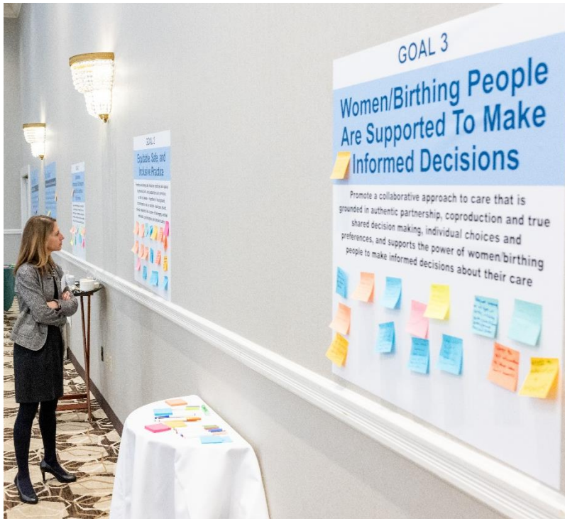
Maternal Health Summit.